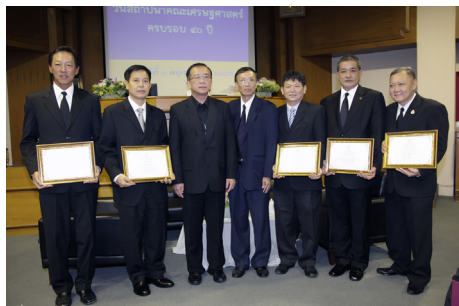
The Faculty of Economics, Ramkhamhaeng University presented outstanding alumni awards