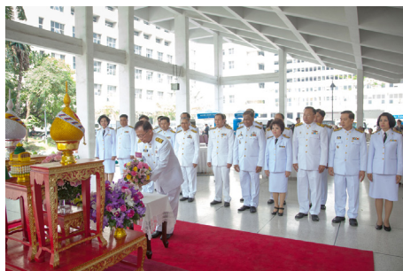
Chulalongkorn Hospital on November 12th.